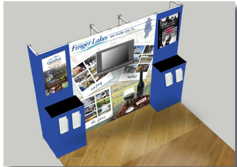
An early booth concept from JEMCO, the company that produced FLTA's new consumer show display.