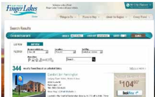
Screen shot of the Book a Room Now search feature on FingerLakes.org.

In January of 2012 the Finger Lakes Tourism Alliance rolled out the Book a Room Now feature on FingerLakes.org. Book a Room Now is a program through Jack Rabbit Systems that ties into an accommodation partner's current reservation system and pulls availability to display on to FingerLakes.org for visitors to search quickly and easily for their accommodation needs.