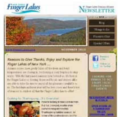
The November 2013 consumer 'public' e-newsletter

*NOTE: Email marketing efforts have been broken down by segmented lists of consumer show attendee leads in order to track effectiveness of each show and determine if FLTA was receiving qualified leads. Numbers listed here are based on FingerLakes.org information request database of over 38,000 opted in email subscribers.